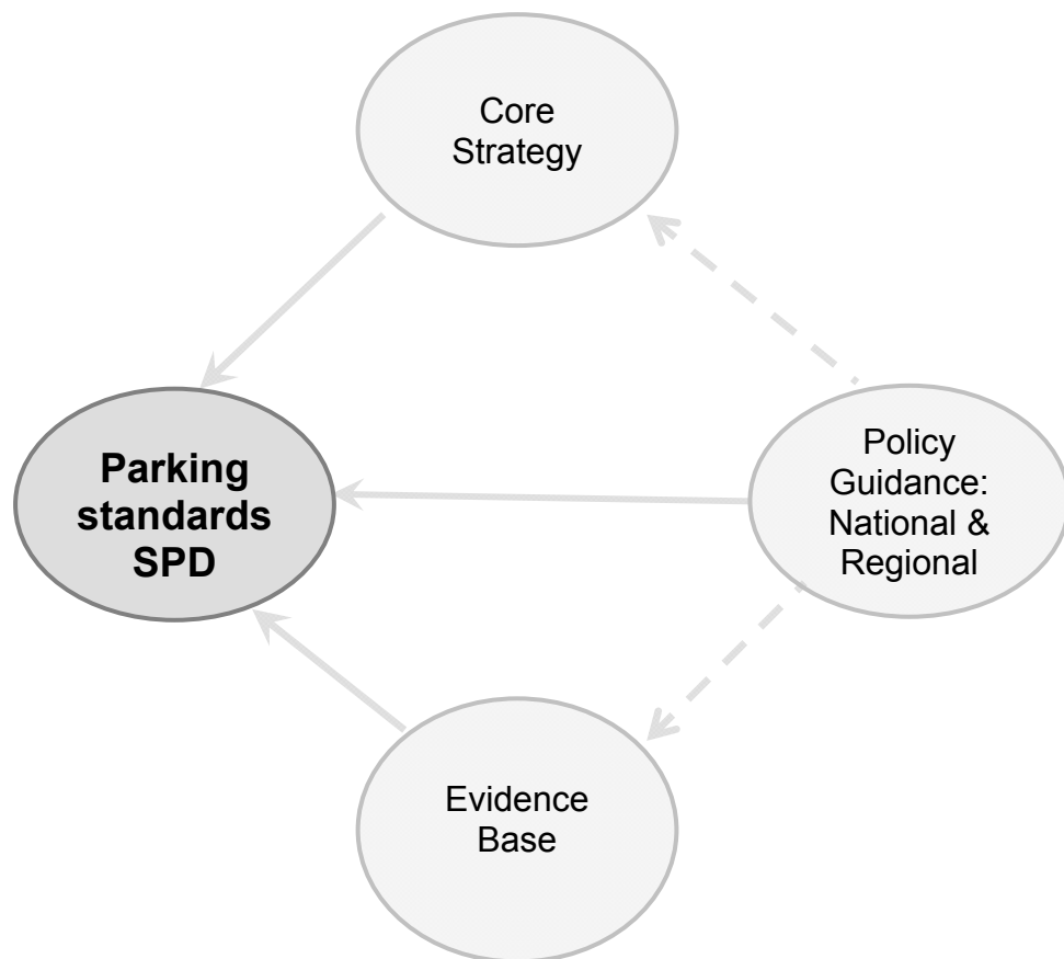
Diagram 1: Relationship with Other Documents