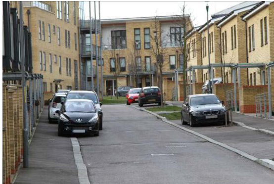
This scheme provides for well-integrated on-street parallel parking. However, the design is undermined by the lack of controls to prevent parking on the pavement.

12. Care should be taken to ensure that accesses and egresses to larger car parks do not create dead frontages on residential streets.