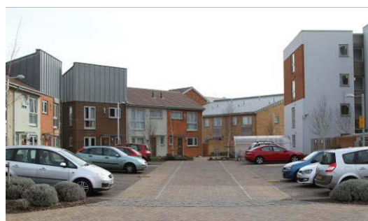
A small parking square with square parking that is overlooked and reserved for surrounding properties. Soft landscaping could, however be improved.