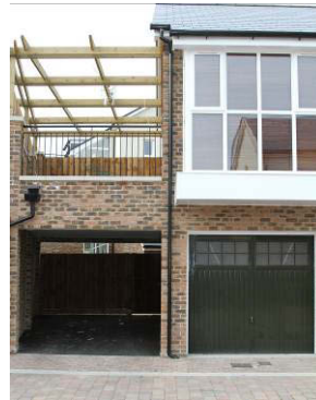
An example of integrated parking with overlooking.