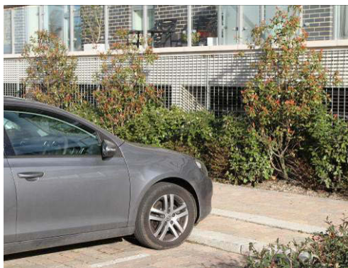
Parking set back to prevent vehicles overhanging the pavement. Soft landscaping has been used to help screen undercroft parking.

13. The street scene should be designed to prevent or discourage parking across emergency vehicle accesses, in turning areas or on footways or pedestrian/cycle desire lines. This can be achieved through measures such as planting, simple bollards, high kerbs, or pinch points. Applicants will be required to demonstrate that their scheme will not conflict with pedestrian and cycle routes.