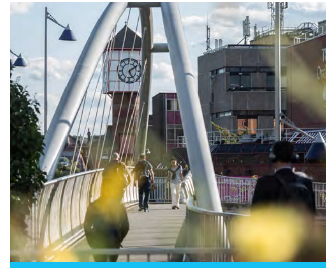
Bridge Between Dartford Station and the Town