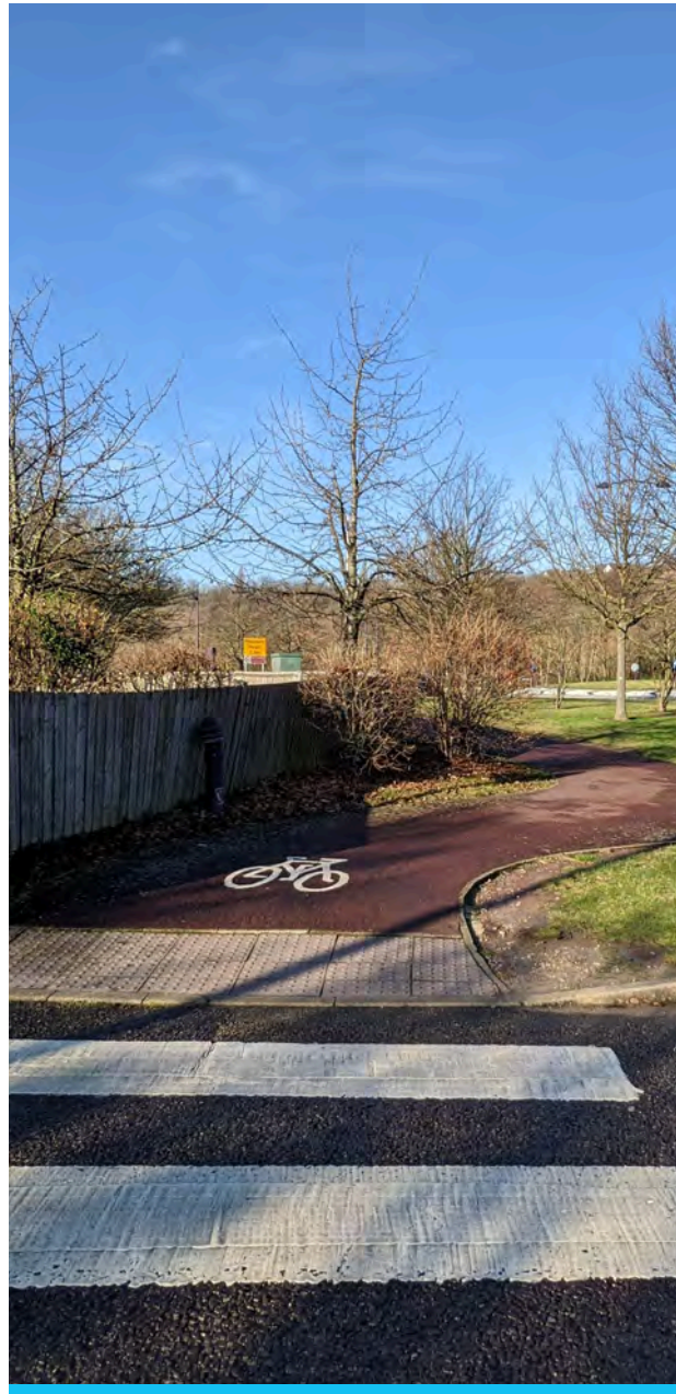
Local Cycling and Walking

We will work robustly with relevant authorities such as National Highways and KCC to lobby for infrastructure and solutions which positively impact the daily lives of our residents and keep our town moving.