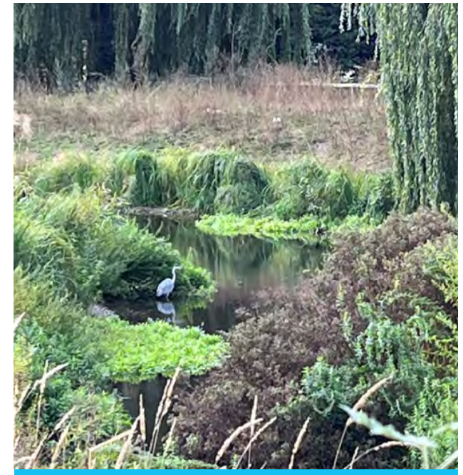
Heron on River Darent