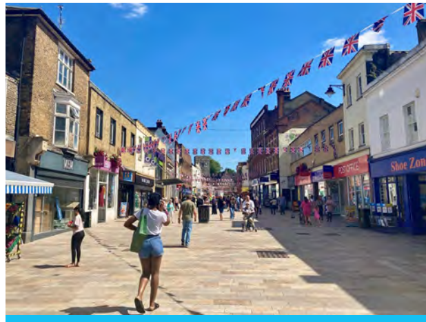
High Street 2023