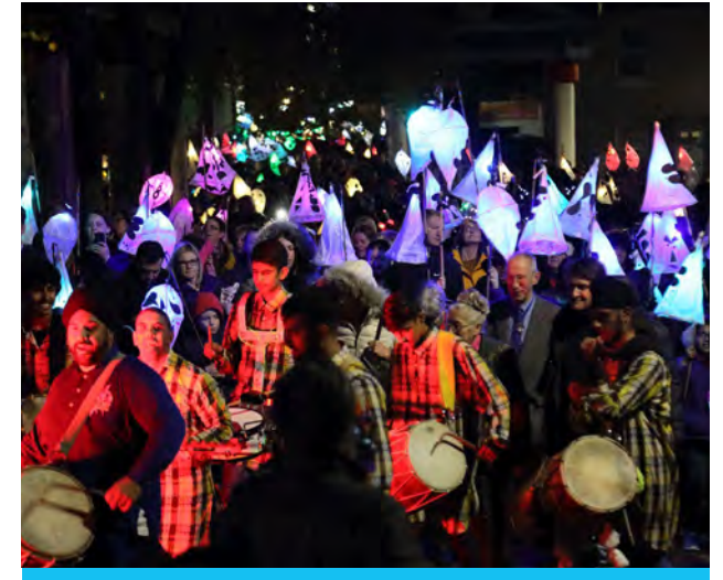
Dartford Festival of Light