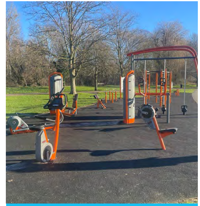
Outdoor gym, Central Park