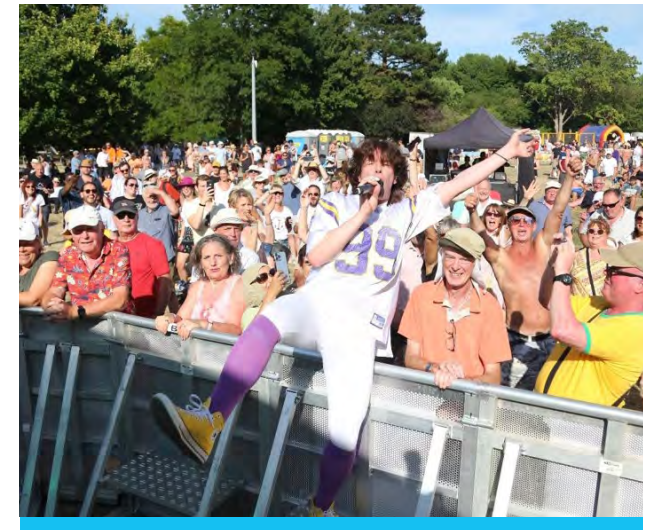
Dartford's Big Day Out

We're not really interested in what other councils do - we want to take common-sense decisions on behalf of our borough and the people who live and work here.