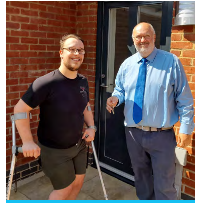
New Accessible Homes