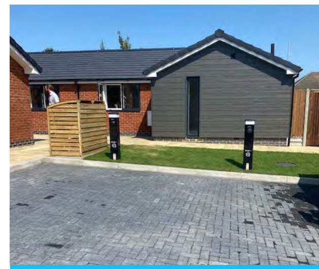
Accessible housing at Mead Crescent