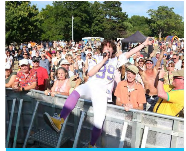
Dartford's Big Day Out

We're not really interested in what other councils do - we want to take common-sense decisions on behalf of our borough and the people who live and work here.