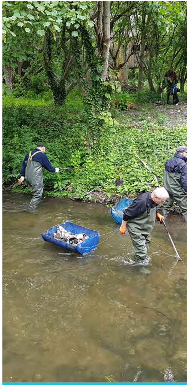
Volunteers Looking After The River

From tackling behaviours which negatively impact our streets to protecting and prioritising our natural environment, we will both lead and influence others. We will adopt a net zero strategy that reflects the way people live.