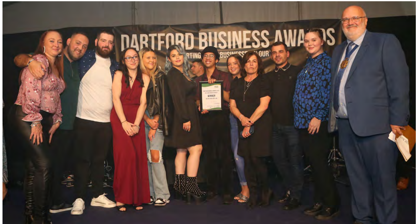
Dartford Business Awards

Places to work, career opportunities at all levels and services that all residents need are all reliant on a growing and changing economy. We will enable our businesses to grow and diversify by taking a positive approach to change and growth.