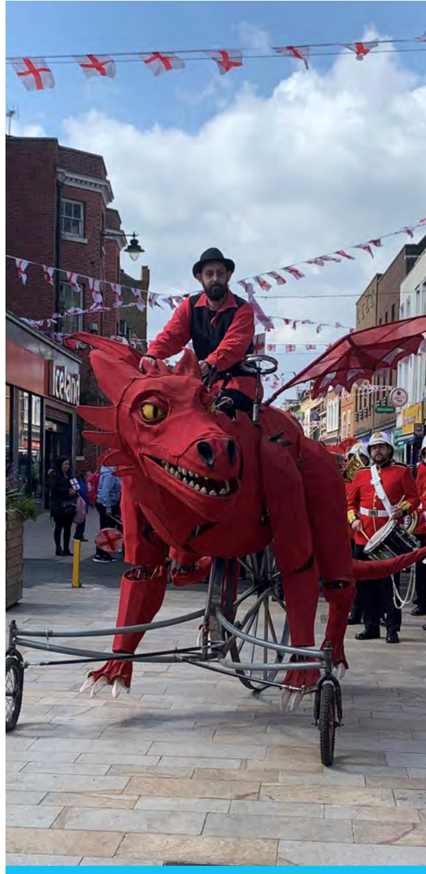
St Georges Day Celebrations

We recognise that culture, sport and heritage are excellent ways to develop communities and bring people together. As such we will provide, support and encourage a wide range of events, activities and facilities.'