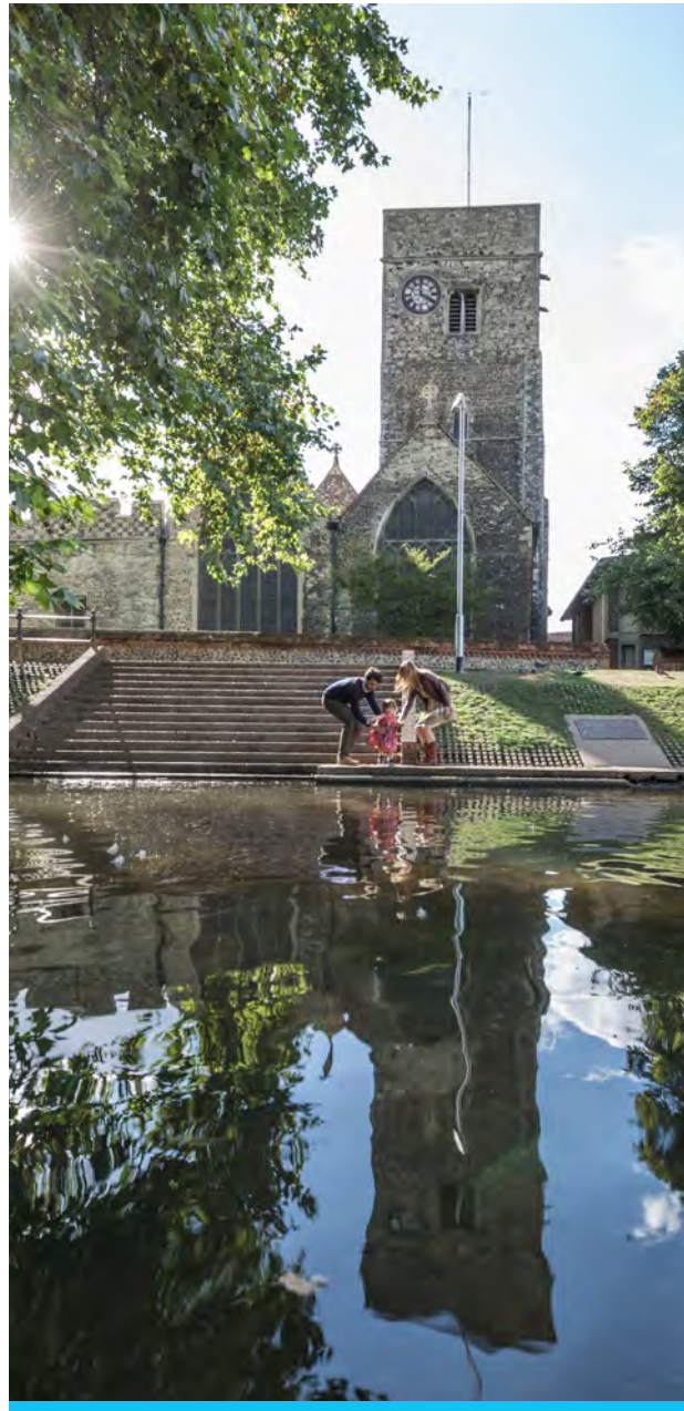
Promoting Better Air Quality

While the delivery of health services is not controlled at Borough Council level we will work to identify inequalities in public health, lobby for accessible health services and ensure our powers are used effectively to improve health outcomes for Dartford people.