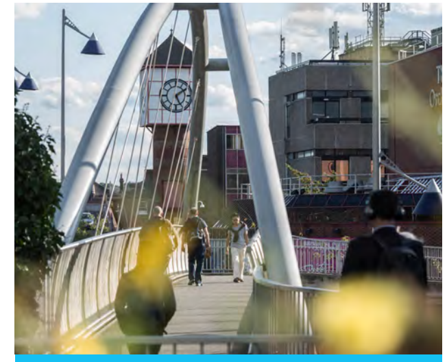
Bridge Between Dartford Station and the Town