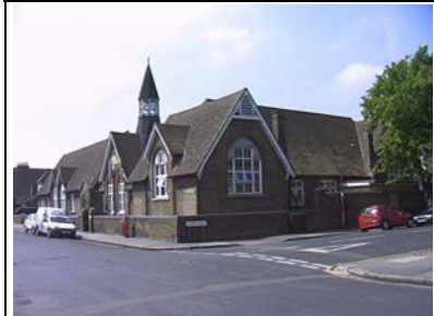
Figure 1- St Albans School

uniformity which existed when the properties were first built. However there is a small core of properties centred around St. Albans Road Primary School, St. Albans Hall and the