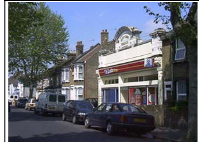
Figure 2- Colney Road Co-Op