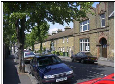
Figure 3- Unity Terrace