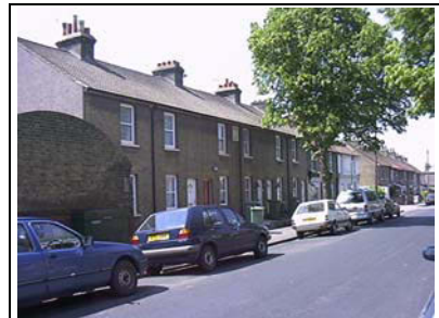
Figure 4- Progress Terrace

local Co-Op shop to warrant the status of ASC.